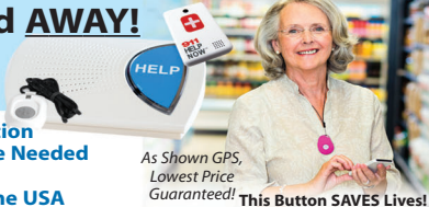
As Shown GPS, Lowest Price Guaranteed!

GPS Tracking w/Fall Detection Nationwide, No Land Line Needed EASY Set-up, NO Contract 24/7 365 Monitoring in the USA