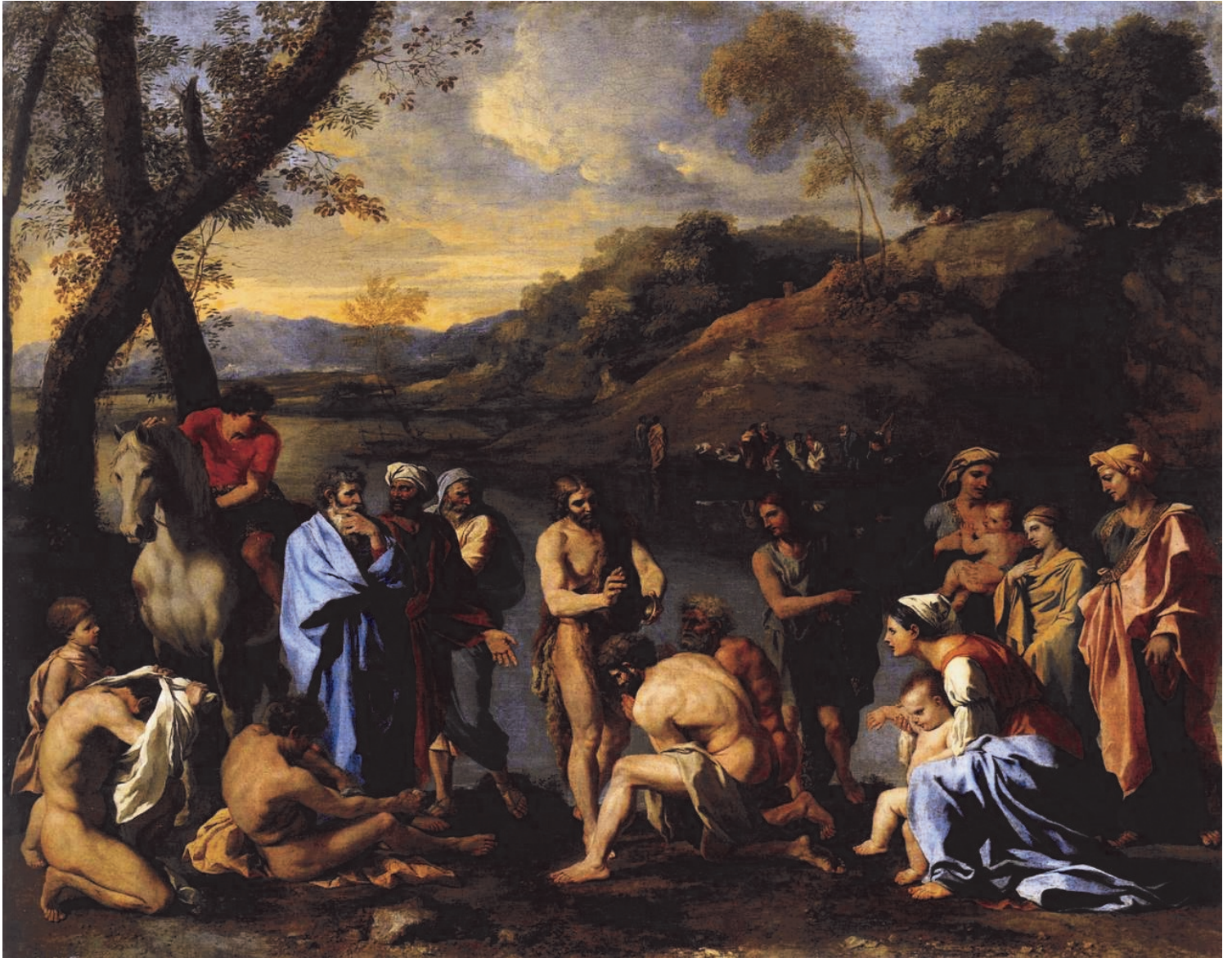
Nicolas Poussin, "St. John the Baptist Baptizes the People," 1635