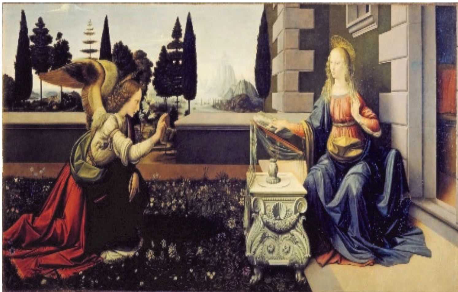
The Annunciation – Leonardo da Vinci (c. 1472)

December 19, 2021 | Fourth Sunday of Advent