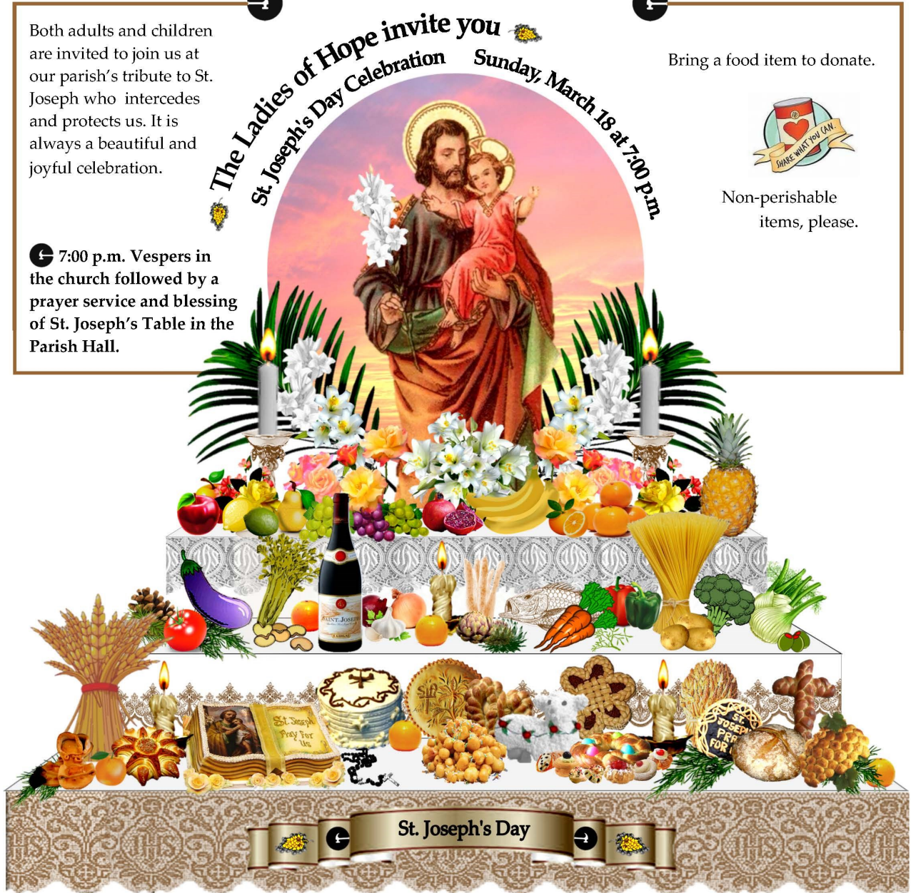
The altar items and non-perishable food donations will be given to a local charity.

7:00 p.m. Vespers in the church followed by a prayer service and blessing of St. Joseph's Table in the Parish Hall.