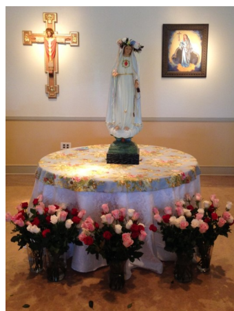
2016 Marian Tea